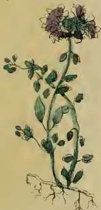
Mother of Thyme.